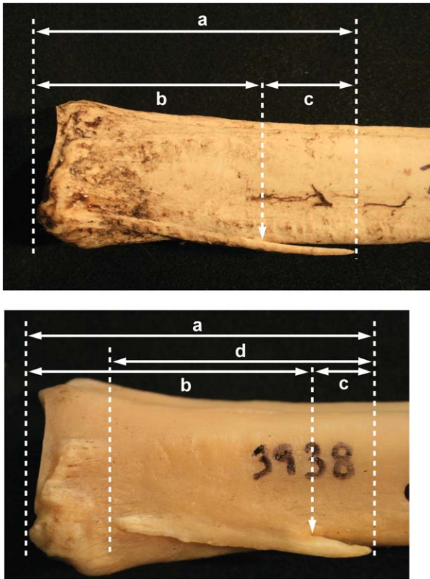
Fig. 1. Lateral view of the proximal end of the cannon bone showing typical examples of lateral metatarsal splint bone structure at the proximal end. In the upper panel, the proximal end of the splint bone fuses with the cannon bone and is indistinguishable. Measurements taken on this form of the splint bone are indicated: (a) distal extension of the splint bone, (b) distal extension of the apposed portion of the splint bone, and (c) length of the free distal portion of the splint bone. In the lower panel, a distinct proximal end is clearly discernable. Measurements taken on this form of the splint bone are indicated: (a) distal extension of the splint bone, (b) distal extension of the apposed portion of the splint bone, and (c) length of the free distal portion of the splint bone, (d) length of the splint bone.

over its whole length or a portion could be separate from the cannon bone. If distinct and separate, the end was subclassified as either intact or broken. Examples of the fused and distinct conditions are shown in Fig. 1. Quantitative measurements on the length of the splint bone could be made on specimens in which the distal end was distinct. For specimens in which the proximal end was fused, the distal extension of the apposed portion was measured from the most proximal extension in the plantolateral quadrant of the proximal articular surface. In specimens where the distal end was not broken, the total distal extension of the splint bone could be measured from the proximal articular surface as described above. It was also possible to measure the length of the free portion of the distal end. The dimensions measured are depicted in Fig. 1 (top panel). The same dimensions were measured in specimens with a distinct proximal end. In addition, it was possible to obtain the measurement of the length of the splint bone, from the proximal